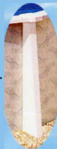
Com-Pac™ II Oval Support System

durability, longevity, and protect the frame's top rail system against chipping and scratching